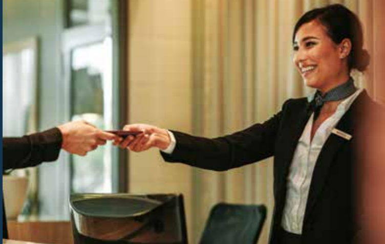
TOP-OF-THE-LINE CONCIERGE SERVICES