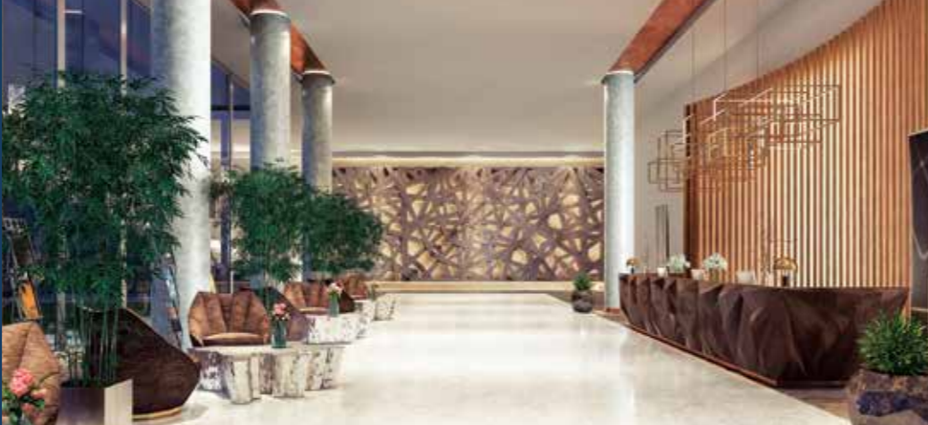
GRAND LOUNGE AREA