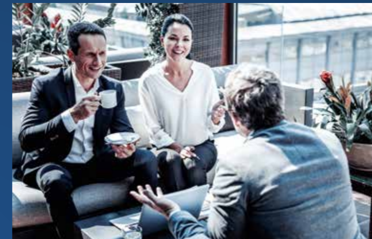
EXCLUSIVE CLUBHOUSE FOR LEISURE, NETWORKING AND GROWTH