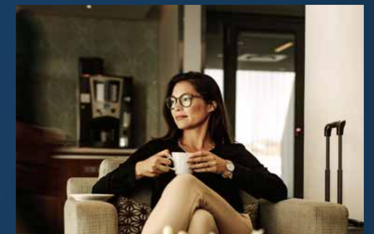
UNIVERSAL ACCESS MEMBERSHIP CARD