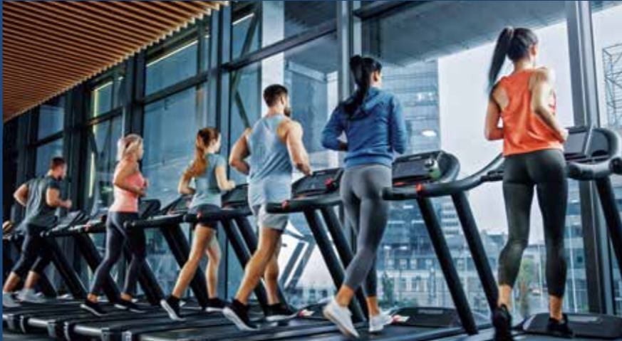
STATE-OF-THE-ART GYMNASIUM, YOGA AND PILATES STUDIO