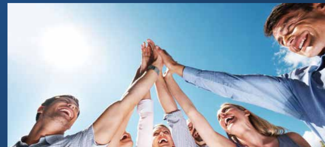
MODERN AND LIVELY ENVIRONMENT