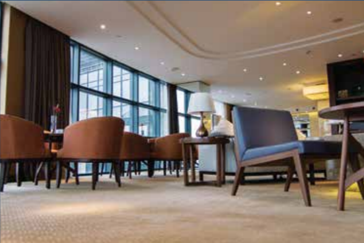
EXCLUSIVE PRIVATE LOUNGES